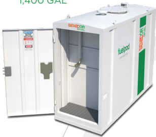
BENECOR ® FUELPod VERSATILE 1,400 GAL