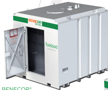
BENECOR ® FUELPod VERSATILE 2,906 GAL