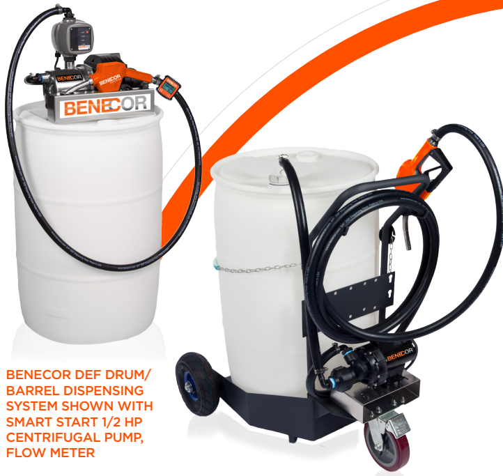
BENECOR DEF DRUM/ BARREL DISPENSING SYSTEM SHOWN WITH SMART START 1/2 HP CENTRIFUGAL PUMP, FLOW METER