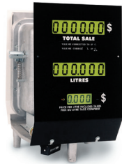
KRAUS GLOBAL MICON™ 500