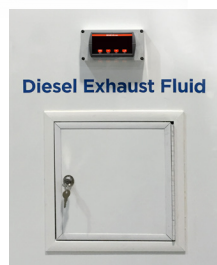
LOCKABLE FILL BOX WITH DIGITAL DISPLAY