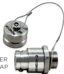
RECEIVER WITH CAP