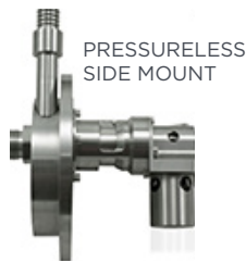
PRESSURELESS SIDE MOUNT