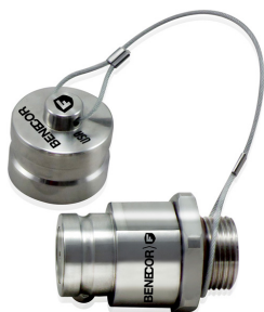
1 1/2" DEF MALE RECEIVER WITH CAP QUICK CONNECT