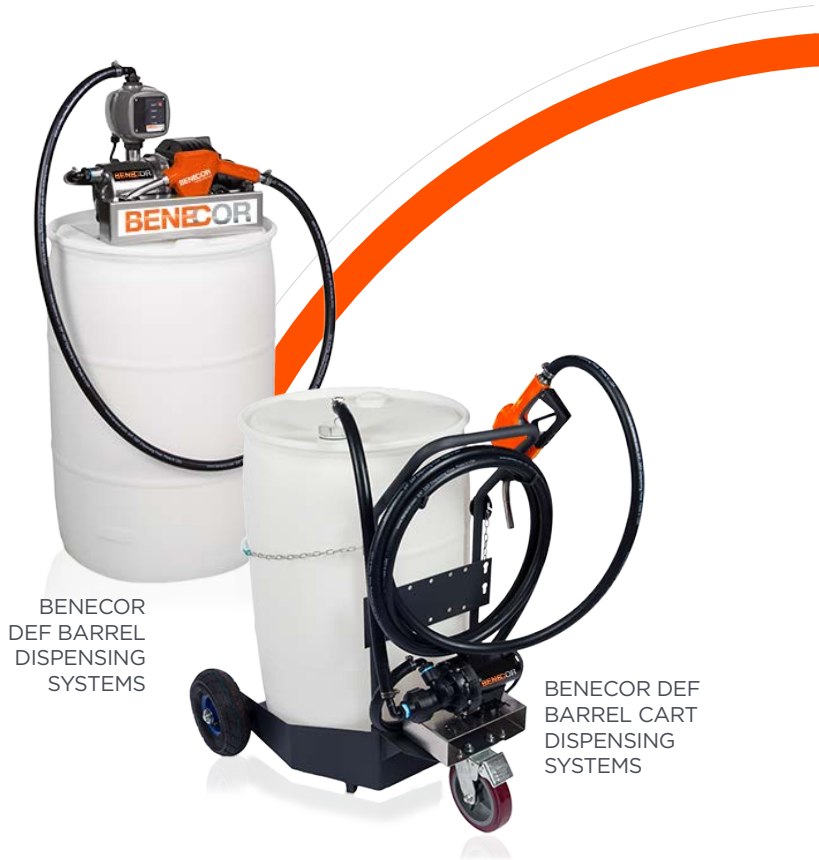
BENECOR DEF BARREL DISPENSING SYSTEMS