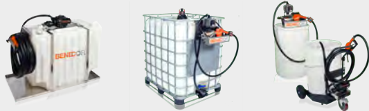
AUTOMATIC DEF NOZZLE: 510COM-SSNOZZ-BEN

CHOOSE BETWEEN: C. DEF 20 Ft. HOSE: 510-HOSE20 D. DEF 20 Ft. CRIMPED HOSE: 800-HOSE20 Swivel